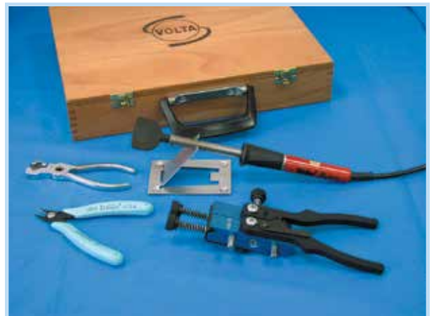
Kit for small profile welding