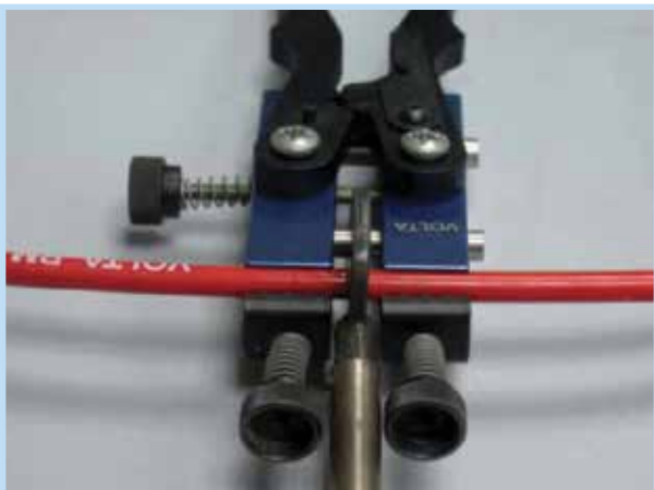
R8 Mini Pliers for smaller profiles