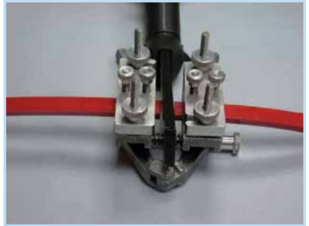
F51 Pliers for larger profiles